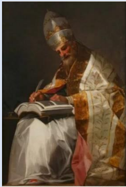
A depiction of St. Gregory the Great by Francisco de Goya

(Practicing) Catholic – Recognize God in your Ordinary Moment) The Patient Gardener