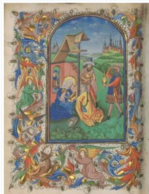
A 15th-century illuminated manuscript showing the Adoration of the Magi

What are the “Twelve Days of Christmas” anyway? Where are they on the calendar?