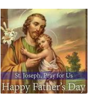
Christ, Lead Him. Christ, Go Before Him. Christ, Bless Him. Amen