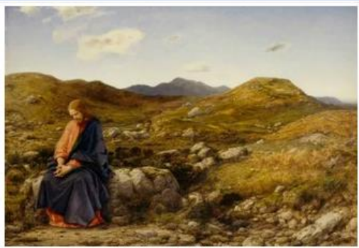
Man of Sorrows by William Dyce

Lent is forty days because Jesus fasted in the wilderness forty days and forty nights before embarking on His public ministry.