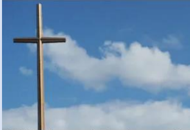
A 208 ft. steel cross marks where the cross was first permanently planted in the USA