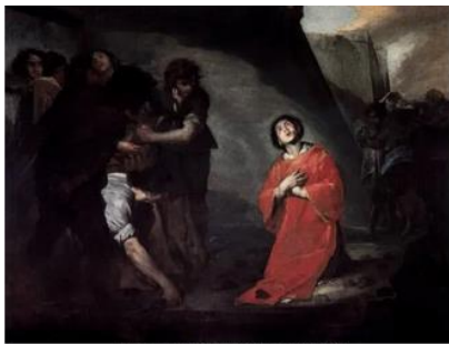
Martyrdom of St. Stephen by Bernardo Cavallino

It performs with pinpoint precision in the most inexperienced hands and is perfectly safe for all ages. It won't ever misfire or jam. It only hurts bad guys. It comes in any color or style you want, and you can outfit it with all kinds of fun accessories.