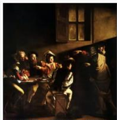
The Calling of Saint Matthew by Caravaggio

Matthew didn't need to make any calculations. He didn't stop and count the cost. He just got up and followed Him.