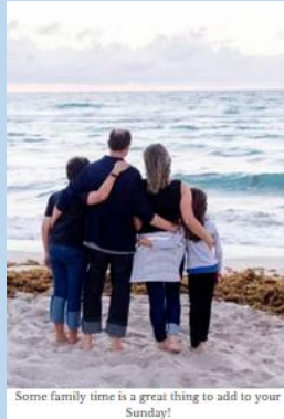
Some family time is a great thing to add to your Sunday!

Well, there are many ways of observing the Lord's Day in a fitting manner. We know what we shouldn't do; let's look at what we should .