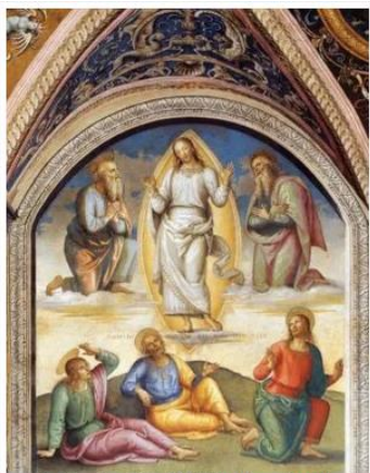
The Transfiguration of Christ by Pietro Perugino

This event was meant to strengthen the disciples in anticipation of the events of the Passion, which would test their faith as never before. We see an instant connection between the Transfiguration and the Passion when we observe that only Christ's closest disciples—Peter, James, and John—are witnesses. Not long after, on a different mount, the Mount of Olives, these three would become witnesses of Christ's Agony, at which time His divinity would be hidden in the darkness of the Passion.