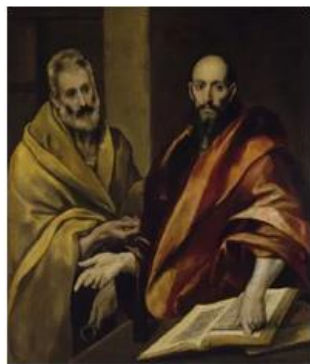
Saint Peter and Saint Paul by El Greco

Peter was the first pope, the prince and head of the Apostles, the rock upon which Christ founded His Church.