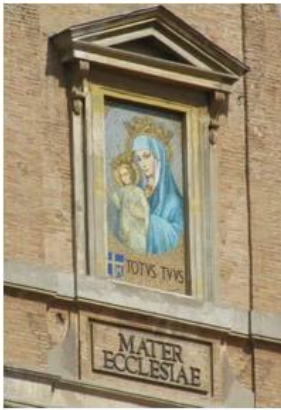
The mosaic of Mater Ecclesiae (Mother of the Church) at the Vatican

Today, in complementary fashion, we honor Mary in her title of Mother of the Church. Although this feast is a new one—created in 2018 by Pope Francis—this title is one of the Blessed Mother's oldest titles.