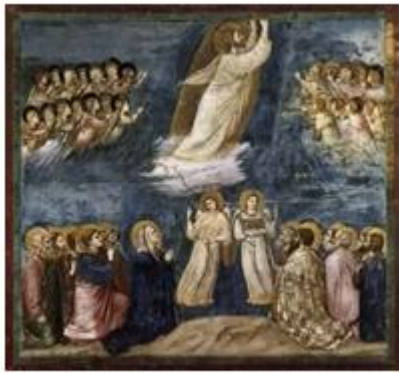
Giotto's fresco of the Ascension

Jesus’ Ascension into Heaven is the completion of His mission on earth. He came not only to save us through His Passion, death, and Resurrection, but also to establish Himself as our continual intercessor. He did this by ascending into Heaven and taking His place at the right hand of His Father.