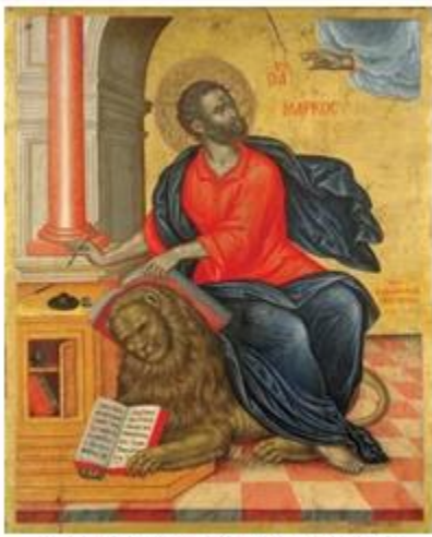
St. Mark the Evangelist by Emmanuel Tzanes

Immediately after John, Jesus Christ appears. St. Mark does not call Jesus the "Son of Man"; he immediately tells us that Jesus is the "Son of God."