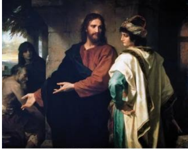
Christ and the Rich Young Ruler by Heinrich Hofmann

Who was this man? Do we know what happened to him?