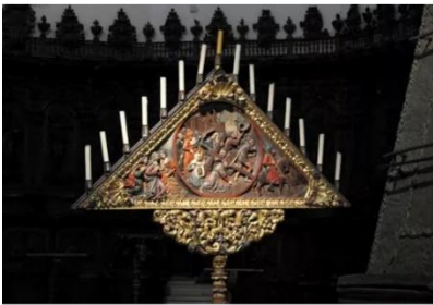
An example of a Tenebrae Hearse from Spain

2. Darkness: A few specific candles are lit on the altar and