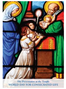
The Presentation at the Temple WORLD DAY FOR CONSECRATED LIFE

will be celebrated in the Church on Thursday, February 2, 2023, and in parishes over the weekend of February 4-5, 2023. Please pray for all those who have made commitments in the consecrated life and be sure to thank them on their special day. May they continue to be inspired by Jesus Christ and respond generously to God's gift of their vocation.