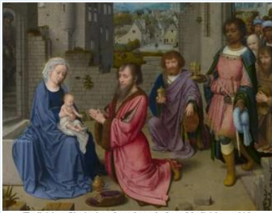
The Epiphany Blessing is performed near the feast of the Epiphany, which commemorates the visit of the Three Wise Men.

This means that your friend’s house has been blessed with a very special, very old custom. The custom echoes the Passover, wherein the Jewish people would sprinkle lamb’s blood over their doorways as an invocation of God’s blessing for their household.