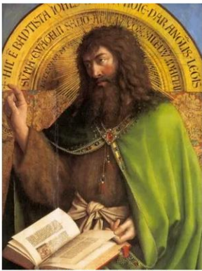
Detail of St. John the Baptist from the Ghent Altarpiece by Jan van Eyck

Besides Our Lord and Our Lady, St. John the Baptist is the only person in the liturgical calendar who gets a feast day for both his entrance into the world (June 24th) and his entrance into heaven (today, August 29th, the feast of his martyrdom). Most saints are celebrated only on or near the day of their death.