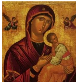
15th c. icon of Our Lady of Perpetual Help

Icon painters, therefore, take the bones of their work