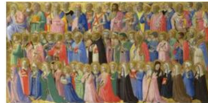
May we join the saints someday!

When five years have lapsed, the bishop can officially open the cause, with the approval of the Holy See, and the person is declared a “Servant of God.”