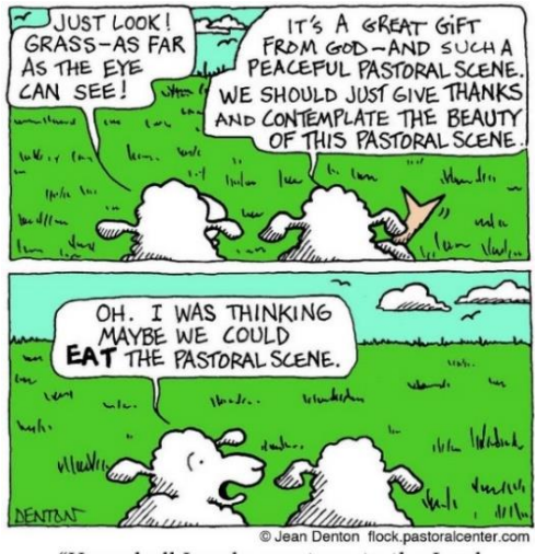
"How shall I make a return to the Lord for all the good he has done for me?"

If you have a special devotion to a saint, it is common to pray a novena leading up to that saint's feast day, or simply any time you have a specific intention that falls under the patronage of that saint. Some popular novenas to saints and angels include St. Thérèse of Lisieux, St. Jude, St. Rita, and St. Michael the Archangel. https://www.catholiccompany.com/getfed/